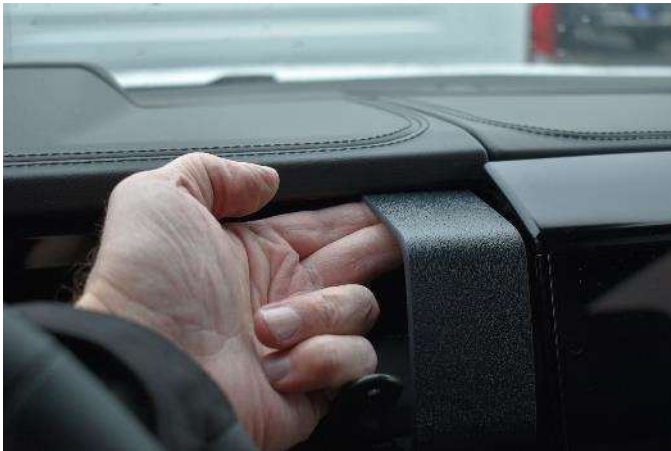
(5) Press the top edge of the mount all the way into the top seam.