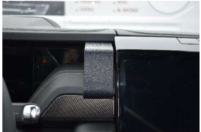
(6) The mount attached. The tape will not leave any residue if the mount is removed in the future.