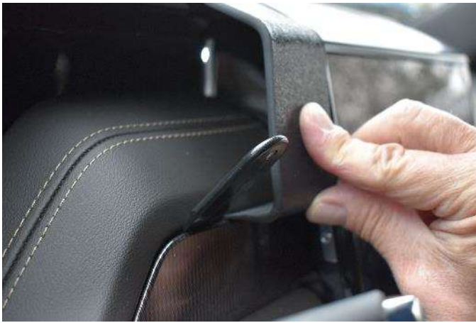
(5) Rotate the mount up to hook the lower edge behind the dash panel.