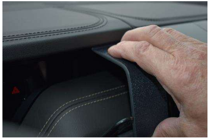
(6) Flex the top edge of the mount down and insert the thin top edge into the upper seam.