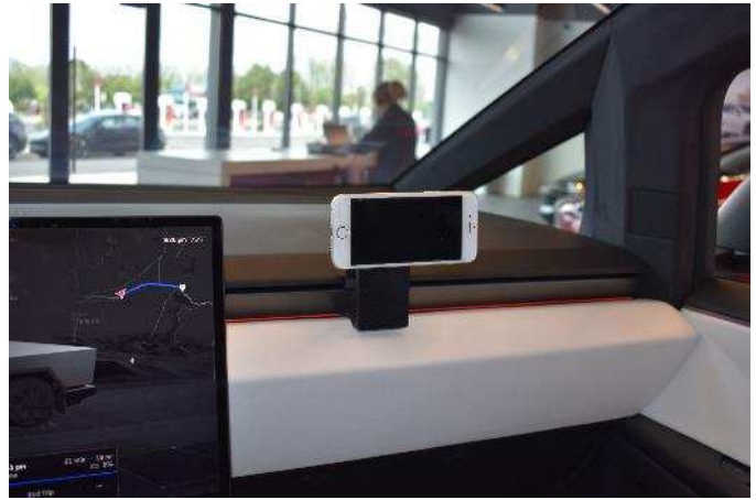
(6) The mount will attach onto many locations on the dash. The tape will not leave any residue if the mount is removed in the future.