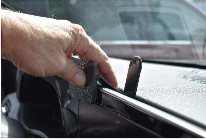
(5) Press the mount forward and then press the front edge of the mount down into the front seam.