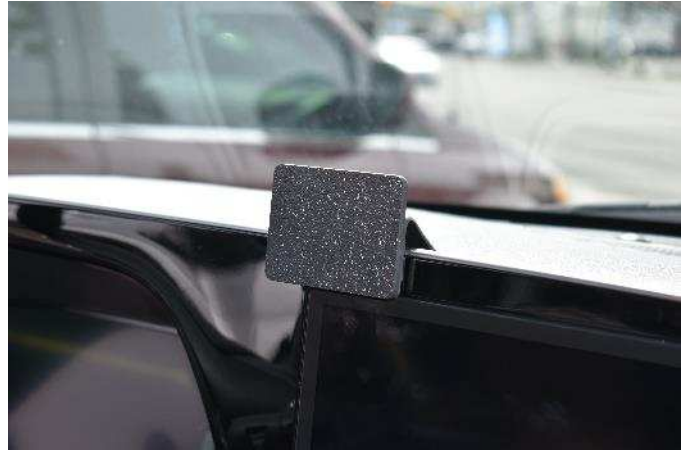
(6) The mount attached. The tape will not leave any residue if the mount is removed in the future.