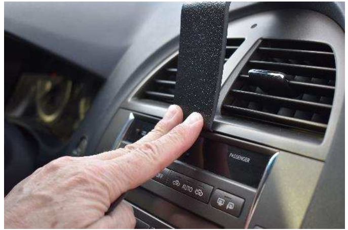
(6) Press the edges of the mount all the way into the seams. The tape will not leave any residue if the mount is removed in the future.