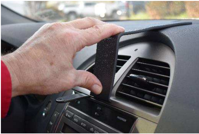
(5) Flex the lower edge of the mount down and into the lower seam.