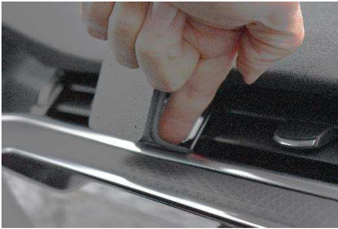
(5) Press the lower edge all the way into the lower seam.