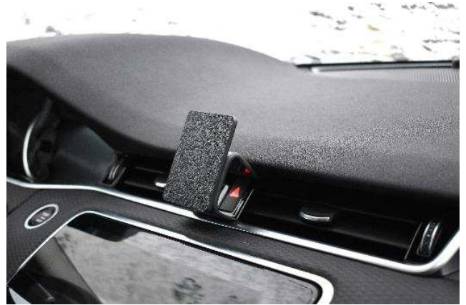
(6) The mount attached. The tape will not leave any residue if the mount is removed in the future.