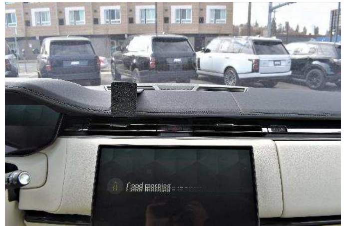
(6) The mount attached. The tape will not leave any residue if the mount is removed in the future.