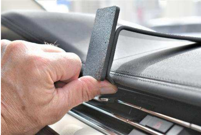
(5) Press the edges of the mount all the way into the seams for a secure fit.