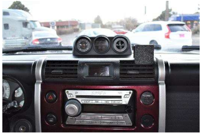
(6) The mount attached. The tape will not leave any residue if the mount is removed in the future.