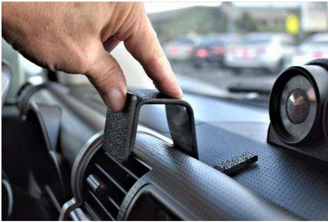
(5) Flex the front edge of the mount forward and hook the thin edge into the front seam.