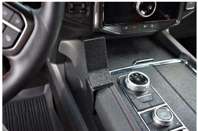
(6) The mount attached.