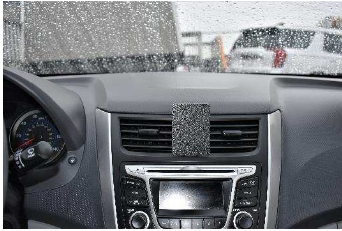
Designed for: Hyundai Accent 2012 - 2017