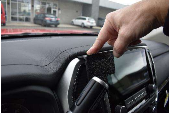
(5) Press down on the top of the mount to make sure the tape connects.