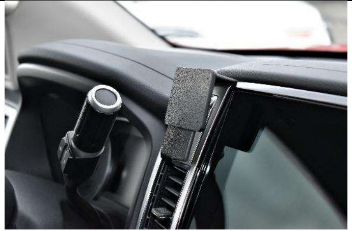
(6) The mount attached. The tape will not leave any residue if the mount is removed in the future.