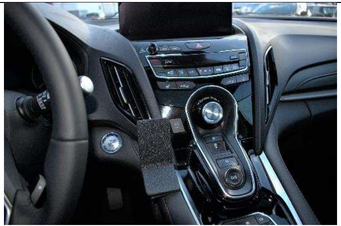
(6) The mount attached.