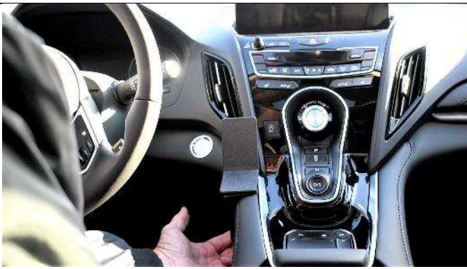
(5) Press upward on the Mount to make sure the mount edge goes all the way into the lower seam.