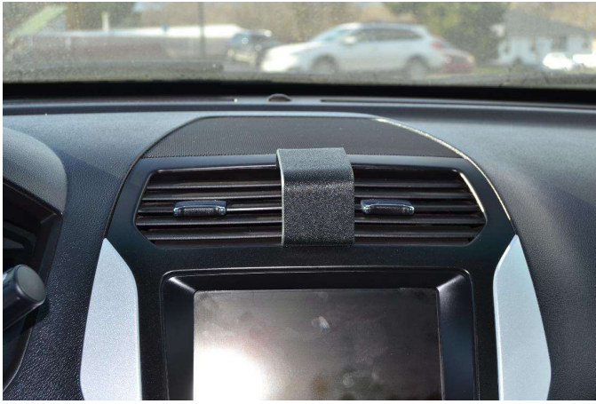
Designed for: Ford Explorer 2011-2015