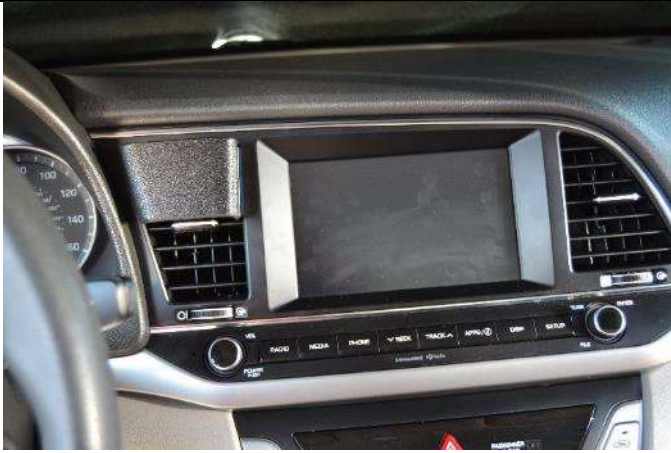
(5) The mount might also have a face plate attached onto it. The tape will not leave any residue if the mount is removed in the future.