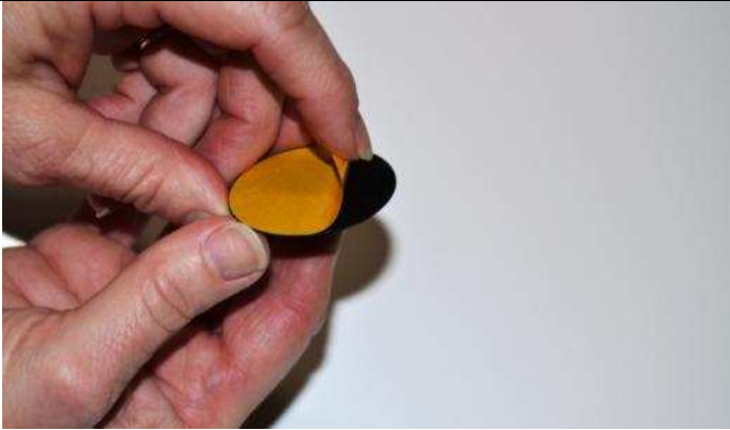
(1) Peel off the cover on the back of the disc.