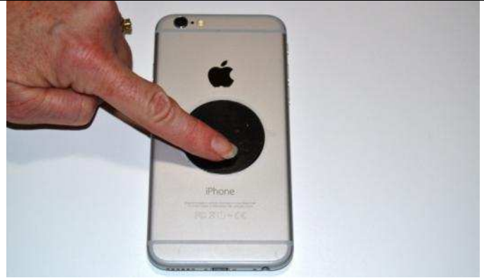
(2) Place the disc onto the center of the back of the device or hard case.