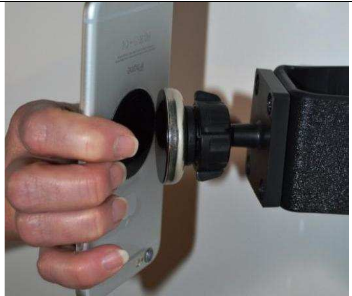
(2) Instead, tilt the device to the right or left first. This will release the device from the holder more gradually and the pull will be easier to release.