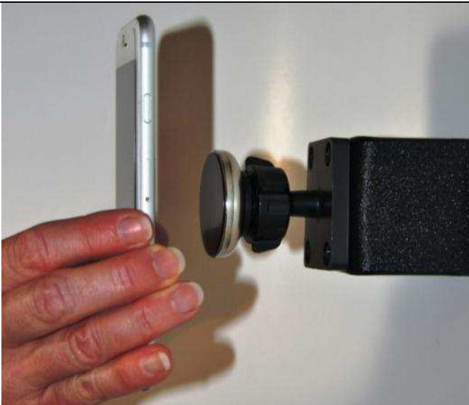
(1) DO NOT pull the device straight off the holder. The pull will be much stronger.