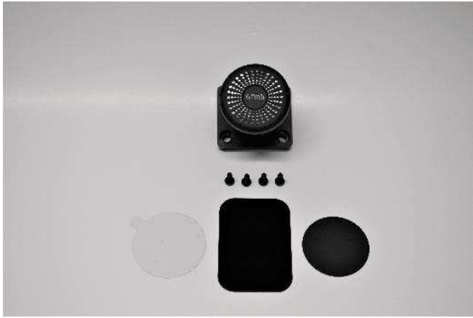
A-Tach Standard Magnetic Holder.

4 - #6 X 3/8 inch Black Pan Head screws are included.